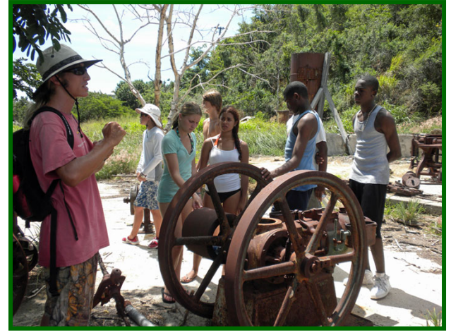
Above: Walking on History: Caribbean History Class Field Trip kayaking to Hassel Island on St. Thomas to visit Creque Marine Railway built in the 1840's.